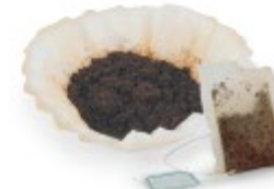
Coffee grounds and tea bags