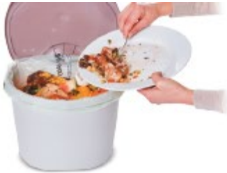
Plate scrapings and leftovers