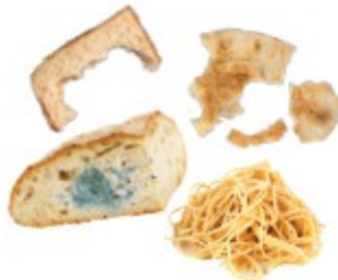
Bread, rice and noodles