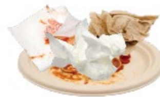
Food dirty paper • Paper plates • Paper towel • Napkins • Used tissues