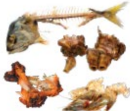
Meat, seafood and bones