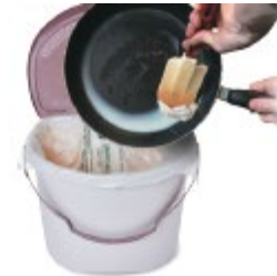
Cooking oil, sauces and grease Tip: Use a paper towel to soak up grease and put in compost too.