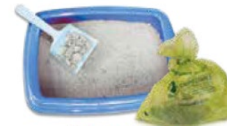
Pet waste Collected in a certified compostable or paper bag.