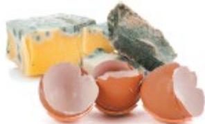
Eggshells and dairy