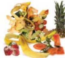
Fruits and vegetables Remove any stickers